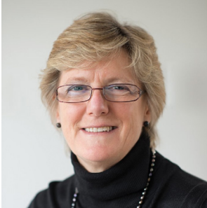
Professor Dame Sally C Davies Chief Medical Officer Department of Health & Social Care

Although many of us enjoy the sunshine, as a result of climate change we are increasingly likely to experience extreme summer temperatures that may be harmful to health. For example the temperatures reached in 2003 are likely to be a ‘normal’ summer by 2040, and indeed globally, countries have already experienced record temperatures. We do not know whether or not there will be severe heat over the course of this summer, but we do want to make sure that everyone takes simple precautions to stay healthy during periods of hot weather and when in the sun.